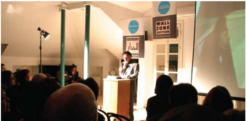
image: The Museum's 3rd Annual Wall Zone Auction