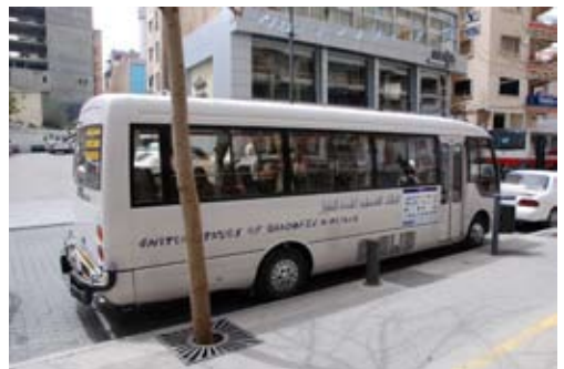
images: United States of Palestine Airlines, Al-Hamra Street, Beirut, Lebanon

FIND OUT MORE about business partnership opportunities at the Museum by contacting our Public Relations team on: