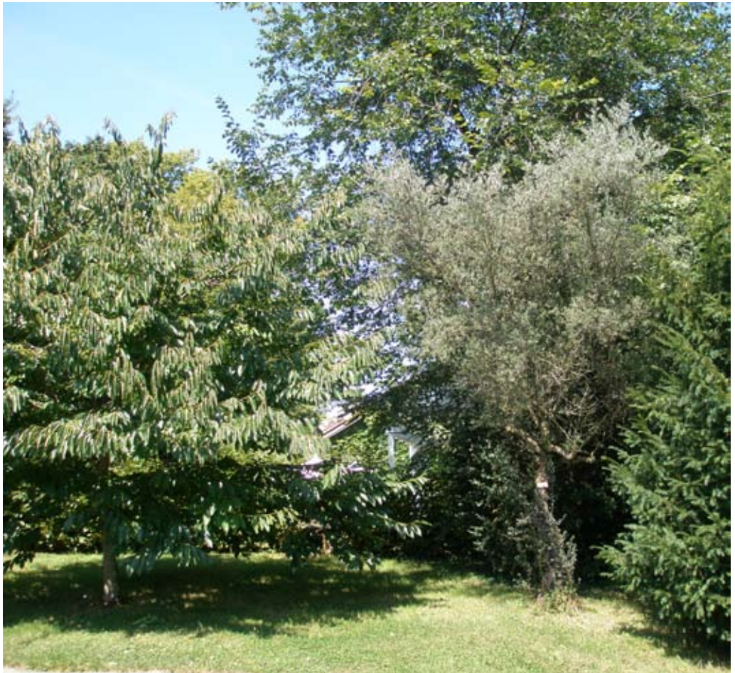
image: Olive tree in Domaine De Penthes/ Conservatoire & Jardin Botanique- Ville De Geneve, 2008

It is this new branch of research that we hope will open up new sources of funding and opportunities for the Museum in its work to redress some of the injustices that have contributed to the destruction of the Palestinian landscape and natural history. Biodiversity and the protection and preservation of the rights of indigenous plants is of increasing relevance in contemporary times for all human life, but especially for the botanical sciences and for the global scientific community as it seeks to intervene in the processes that have led to injustice and destruction. The Palestinian Museum of Natural History and Humankind will take its place at this table.